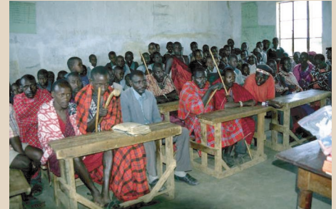
Community members met to discuss the construction of their new classrooms.