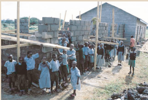
Students often visited the construction site.