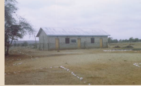
This building was too small to meet the educational needs of the Merrueshi community.

In 2001/2002, Woodland Park Zoo, through grants and volunteer/staff donations, provided funds to Maasai people of southeastern Kenya to construct two new classrooms in the Merrueshi community. A dream became reality.