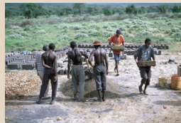
Maasai youth made bricks for the school's walls.