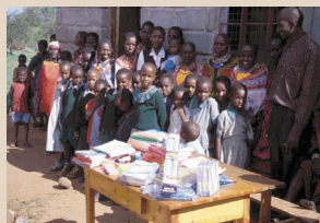
The Merrueshi community received school supplies donated by Woodland Park Zoo.