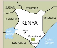
The Merrueshi community is located in the savanna of southern Kenya, near Amboseli National Park.